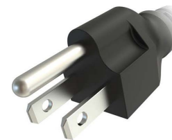
Standard Nema 5-15 Connector